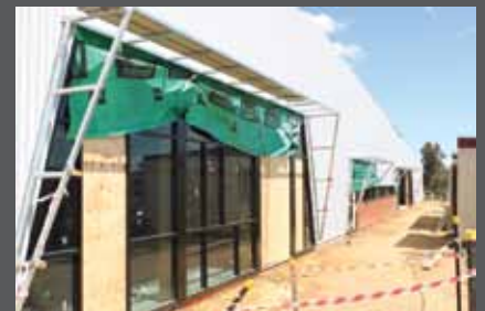
Lucknow Primary School's new $3 million multi-purpose centre

For more information on the Building the Education Revolution program visit www.education.vic.gov.au/buildingrevolution .